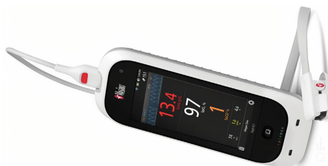
Fig. 1. Masimo Rad-67 device and Mini DCI sensor.

In addition, our results showed better SpHb accuracy than that of Osborn et al. (2019), who compared SpHb with Hemocue 201 Lab Hb measurements in 201 patients in the ED and found that the bias between SpHb and Lab Hb was -0.52 \pm 1.41 g/dL [14].